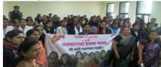
Human Right Cell & Women empowerment Cell organized every Year 08 March as Rights of Girls and their empowerment Issues