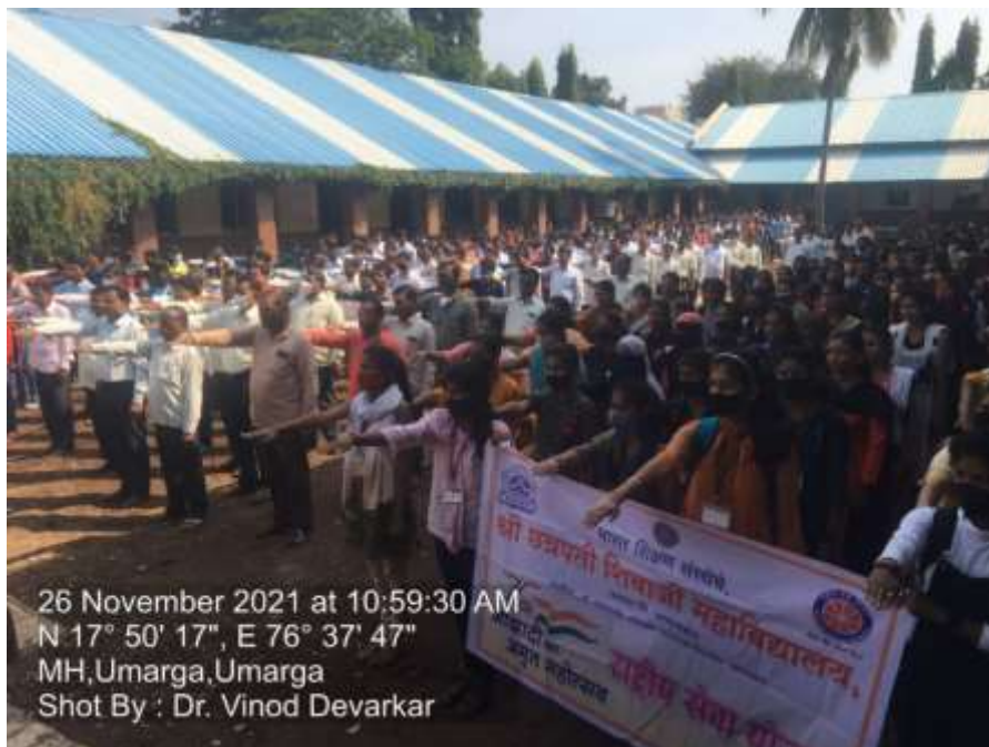
26 November 2021 at 10:59:30 AM N 17° 50' 17", E 76° 37' 47" MH, Umarga, Umarga