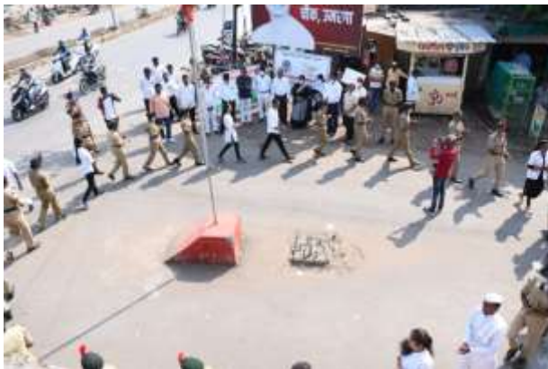
Road Show on Beti Bachav Beti Pdhav