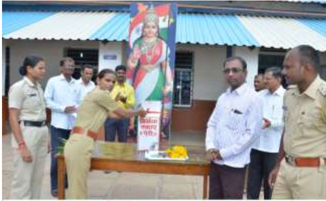
Nirbhaya Peti inauguration and Counselling by Police Dept Omerga