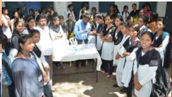
Shri Chhatrapati Shivaji College Omerga HB check up Camp For Girls