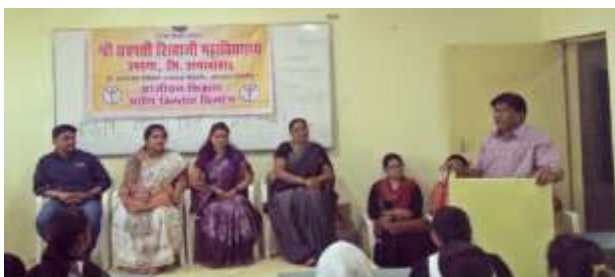
Woman Empowerment Cell जागतिक महिला दिन महिला सबलीकरण- व्याख्यान