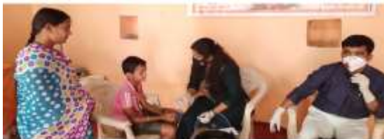
Jijau Girls Culb orgainzed Health Chek up Camp

Jijau Girls Rotaract Club of college organized health check-up programs