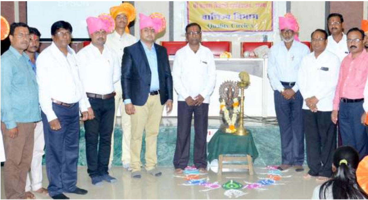
Workshop is inaugurated by Principal -16-01-2017